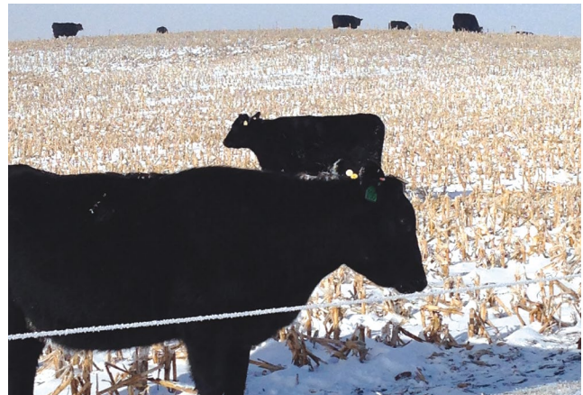
Crop residue grazing northeast South Dakota

These values and rates are regional and should only be used as a guide and are not an indication of values for specific properties.